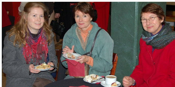
After the tour, tea and scones!

The theatre is supposed to have a ghost dancer - a Russian ballet dancer named Yuri is said to have died falling off the fly floor. For more than 60 years afterwards, people have reported strange occurrences believed to be the work of Yuri, roaming the corridors and stage of this historical Theatre. I'm not sure if anyone actually saw Yuri, but either way everyone seemed to find the tour very informative and interesting because it covered all those parts of the theatre operation that most people never get to see.